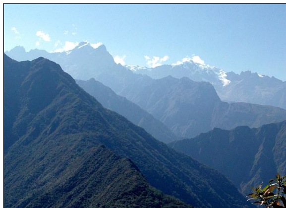
Section of Trail near Sun-Gate