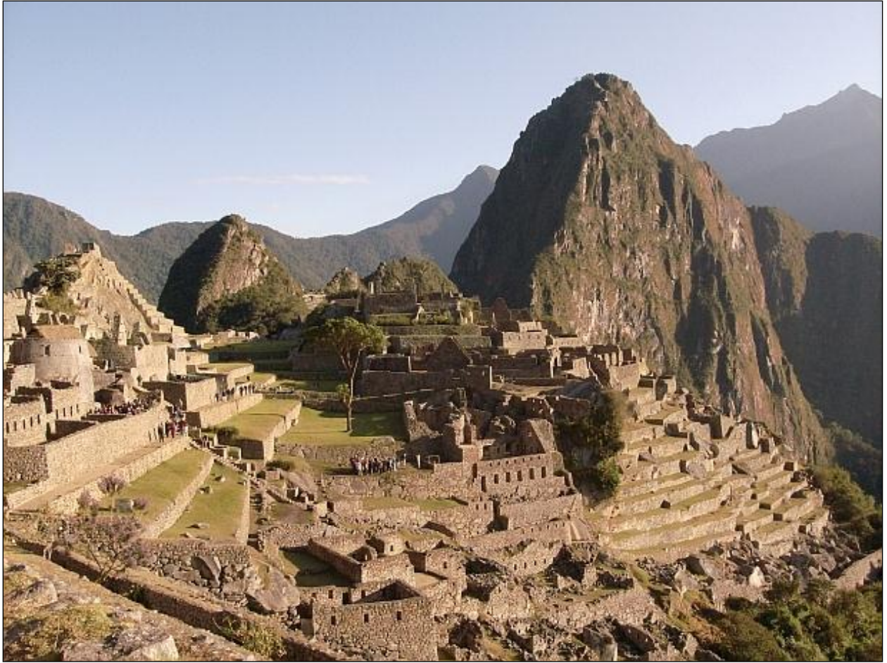
Finish Line: Machu Picchu