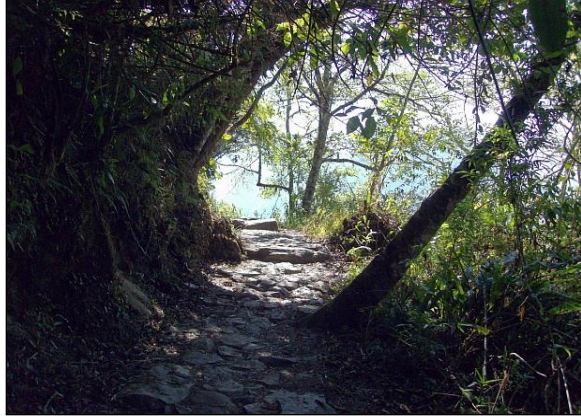
Trail section in cloud forest