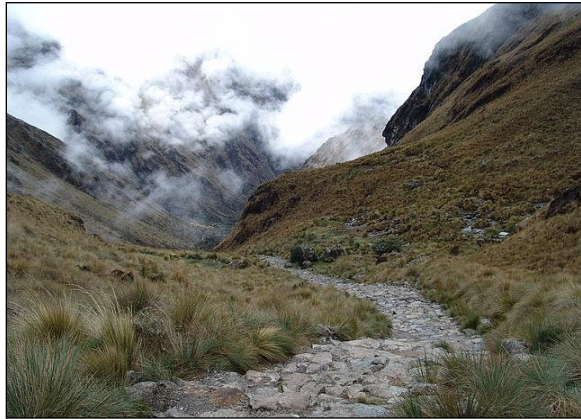
View from Dead Woman's Pass