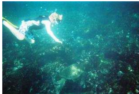
Note sea turtle just beyond reach.