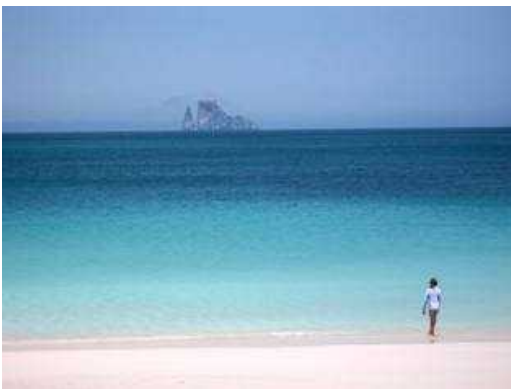
Typical hectic morning, Galapagos, Ecuador.

Tues. Aug. 3: All day chartered boat trip to tip of the island and islets. Snorkeling with sharks, rays, turtles and sea lions. Visit nesting grounds of Frigate Birds, Pelicans, Boobies, Tropical birds, etc. Roam gorgeous, deserted, pristine beaches that could make travel posters cry.