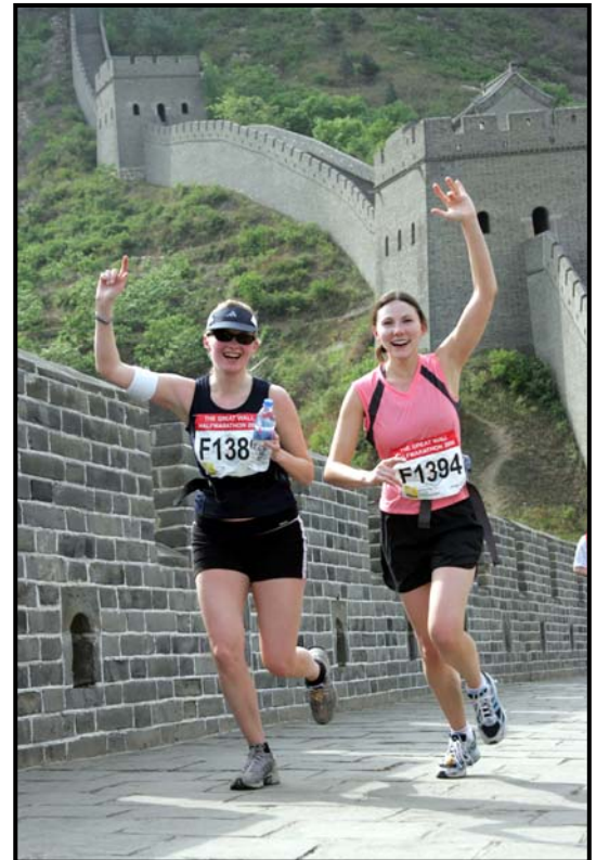
The Imperial Run

Please note: You must personally sign this agreement. By signing you acknowledge that you have read, understood and accepted the Exclusion of Liability contract.